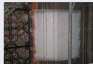
The masonRE® Latex product is sprayed on the substrate with an airless sprayer