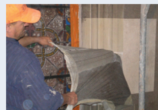
Dirt, grime and soot adhere to the back of the dried masonRE® Latex, which is peeled off, leaving a cleaned substrate